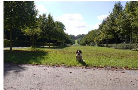
Saint Cloud Park