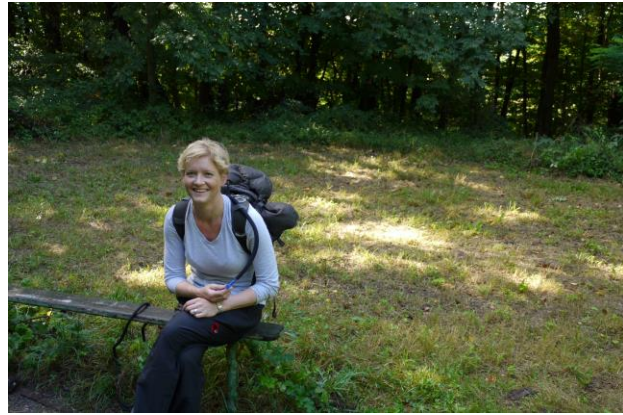
Stopping for a rest!