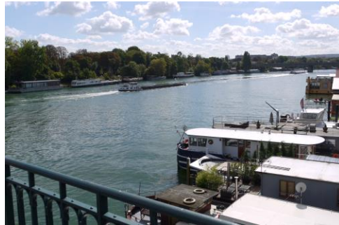
The River Seine