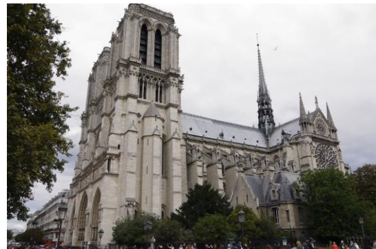
The finish line! Notre Dame Cathedral