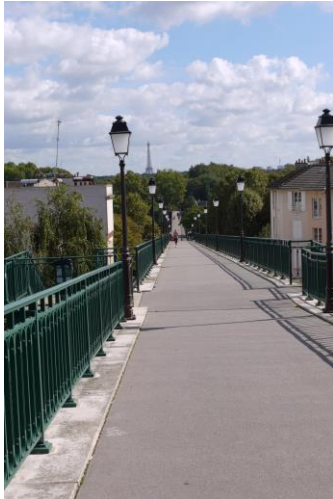
The Eiffel Tower in the distance