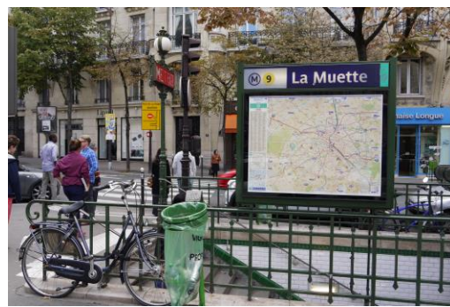
La Muette metro station