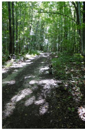
The forest of Fausses Reposes