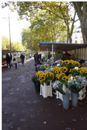
A lovely flower market

and some of the places Pepper (our Springer Spaniel) and I passed on our route;