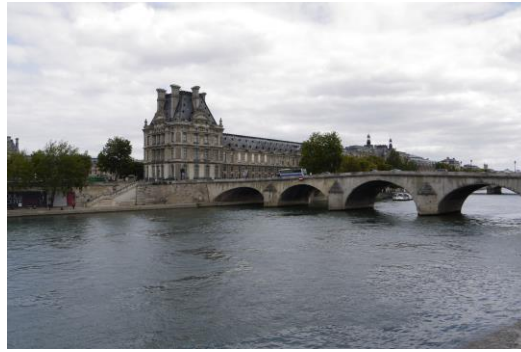
The Louvre from the river