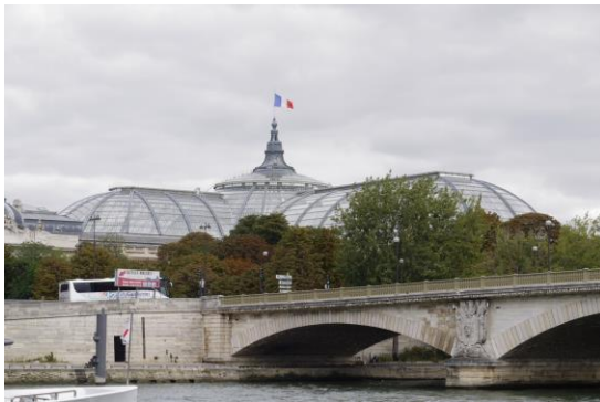
The Grand Palais